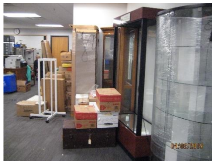
After the move

Then the work for the volunteers began. A Minnesota Historical and Cultural Heritage grant purchased archival storage materials and provided a consultant to work with the volunteers to learn how to properly store artifacts and place in new boxes. A group of volunteers worked 5 long days on the "restoring" project and the work continues.