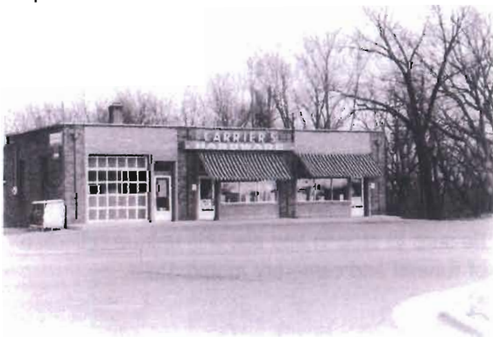
Carrier's Hardware SE Corner of Lexington and Woodhill